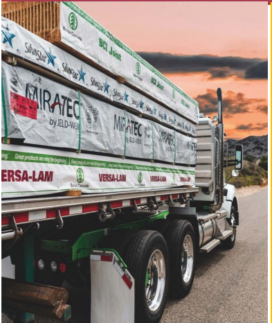
Serving Lumber & Building Material Dealers for over 60 years

October is National Depression Education & Awareness Month www.NationalDayCalendar.com